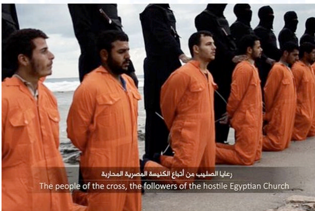
Coptic Christians Beheaded by ISIS

Since the fall of Maummar Gaddafi in October, 2011, Libya has been overrun by competing armed militias, many of them aligned with ISIS. For Christians, Libya has become the “killing fields” of the 21 st Century.