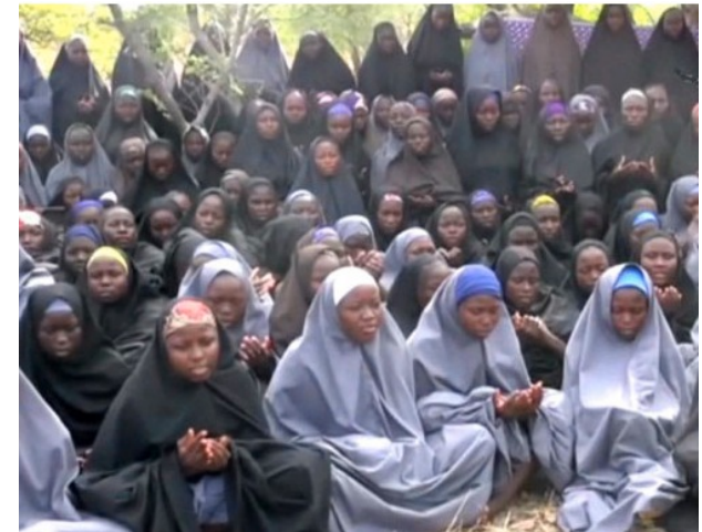
Kidnapped Girls in Nigeria